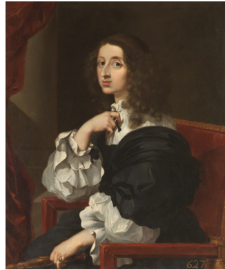
Image 10. Queen Christina in an armchair. Sebastien Bourdon (1653). Collection: Museo del Prado Madrid.

(image 10) and the equestrian portrait, were derived from the second basic portrait. When looking at this one and the two canvases for the Spanish king, it is immediately clear that Christina's head is depicted almost identically in these paintings. (See image 13.) Looking at the original paintings, it is also clear that the person portrayed is always depicted at natural size. The tradition of portraiture had spawned this aesthetic standard, which brought with it an important additional advantage that stencils were always the right size. It also meant that painted portraits usually had more or less standard heights. A chest portrait of an adult was about 80 cm. in height, a half-high portrait about 105 cm., a portrait up to the knees 150 cm. and a full-length portrait of 200 cm. That Bourdon's equestrian portrait of Christina and Rubens's equestrian portrait of Archduke Cardinal Ferdinand, as we saw before, both were about 340 cm. high was no coincidence either.