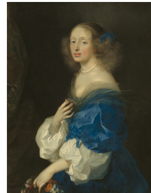
Image 8. Ebba Sparre. Sebastien Bourdon (1653). Collection: National Gallery of Art, Washington.

The two portraits intended for the Spanish King Philip IV, a half-high seated portrait