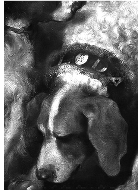
Image 3. On the collar to the left of the medal the L of Legatus, to the right DA of Dominus Antonius. On the medal itself the initials CRS of Queen Christina.