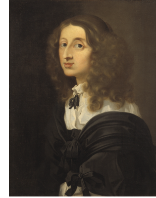
Image 11 (left). Basic portrait 1: Queen Christina with loose hair. Bourdon (1652). Private collection.