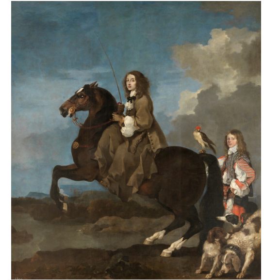
Image 1 and 2. Left: Archduke Cardinal Ferdinand of Austria on the battlefield of Nördlingen by Peter Paul Rubens(1634-1635). Collection: Museo del Prado Madrid. Right: Equestrian portrait of Queen Christina of Sweden by Sébastien Bourdon (1653). Collection: Museo del Prado Madrid. The two canvases hung side by side in the dining room of the royal palace in Madrid, the Alcázar.

publications about this well-known painting by Sébastien Bourdon have become infected with it. That has some significance, because the dimensions play a special role in the history of the canvas.