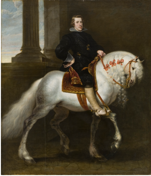
Image 4. Equestrian portrait of King Philip IV of Spain. Anonymous Flemish master. Collection: National Museum Stockholm.