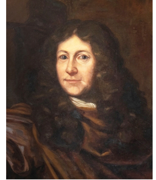
Image 7. Mathias Palbitzki. Copy (fragment) after Ehrenstrahl (1665). Collection: Nordiska Museet Stockholm.

ving south 8 and that she is leaving dark Sweden behind. It indicates her intended abdication and subsequent conversion journey to the south. Philip IV and Pimentel were among the few who knew about it.