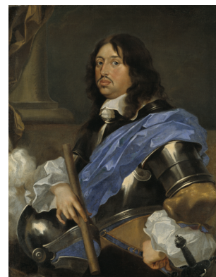
Image 9. Crown Prince Karl X Gustav. Sebastien Bourdon (1653). Collection: National Museum Stockholm.