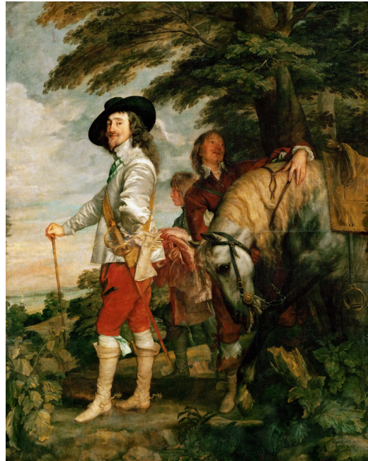
Image 14. Charles I on the hunt. Anthony van Dyck (c. 1635). Collection: Louvre Paris.